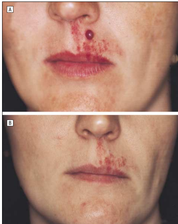
Figure 2. A, Patient with pyogenic granuloma on the upper lip. B, Status 5 weeks after a single therapy session with the continuous-wave/pulsed carbon dioxide laser. The lesion has healed completely without scars.

possible with other coagulating lasers (eg, argon and CW Nd:YAG), but when it comes to the delicate task of removing the basis of the lesion, vaporization in pulsed mode has proved to be advantageous. Extremely thin skin layers can be removed, thus allowing differences in skin levels to be gently evened out. This can only be achieved with pulsed CO 2 lasers.