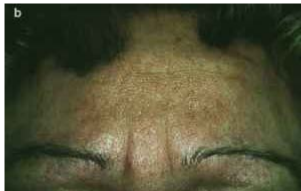
fig1: Sixty-two-year-old female patient with multiple sebaceous hyperplasia of the forehead: (a) before treatment, (b) after treatment sessions with the pulsed dye laser

Patient 2, a 58-year-old man, suffered from a single sebaceous gland hyperplasia of the forehead (Fig. 2a). Laser treatment was applied during two consecutive sessions (5 mm laser probe, 6.5 J/cm 2 and 6.8 J/cm 2 energy dose, respectively).